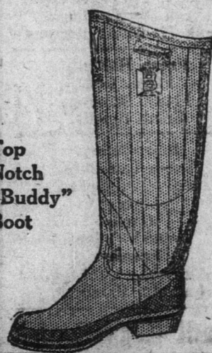
Top Notch "Buddy" Boot