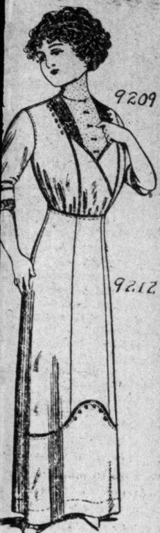
Ladies' Waist Pattern, Ladies' Skirt Pattern.

voile with facings of... and embroidered net in... used for the develop-... waist fronts are shaped... beneath the chemisette... short sleeve is finish-... cuff. The skirt has a... portion, lengthened by a... The entire costume... yards of 40 inch ma-... medium size. The waist... in 5 sizes: 34, 36, 38... chest bust measure. The... in 5 sizes: 22, 24, 26, 28... waist measure.