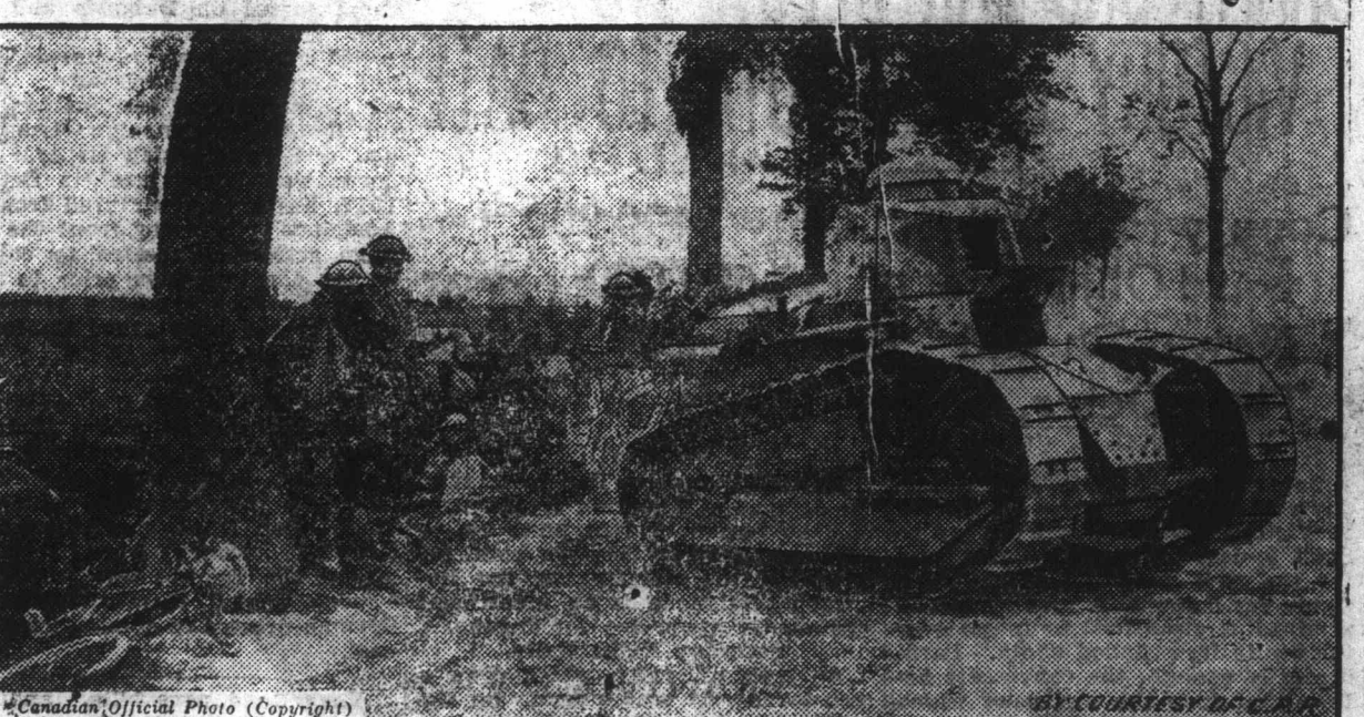
A Canadian Brigadier General in a tank starting on a reconnaissance. He was heavily shelled while passing three h what was a few moments before a German stronghold

The graveyard at La Boisselle, on the Albert-Bapaume road, shows the graves and simple wooden crosses in memory of three brave officers of the famous 87th Battalion, Canadian Grenadier Suards, all killed the same day.