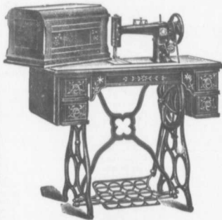
Cabinet No. 2.

Guaranteed for five years. Regular price, $45.00.