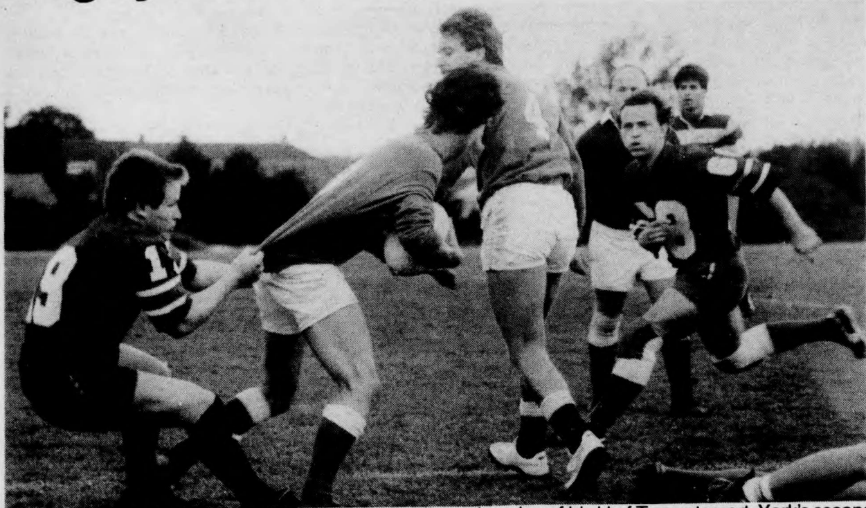
WHOA! A member of York's second rugby team pulls on the reins of his U of T counterpart. York's second team beat U of T 17-9, while the first team clobbered U of T's finest 35-9.