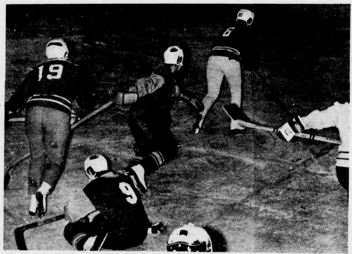
Positions girls! Positions!

H. PROCTOR & CO. Diamond and Gem Dealers 921-7702 131 Bloor St. W. Suite 416