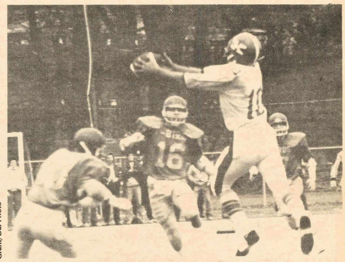
...And still another dropped pass for the X-men. There just wasn't much to say about the Atlantic Bowl last weekend at SMU - if you were a St. F.X. fan. The X-Men took a brutal drubbing at the hands of the undefeated UBC T-Birds 54-1.

For many it was the first opportunity to view the new rink and most seemed very impressed with the structure's unique ribbed roof. However, one dissenting vote on the roof was overheard when a young fan remarked, "The wood in the roof looks grody, Mom." Other comments on the seating (or lack of seats) were not as favourable but most seemed to take the cold concrete seats with stoic good nature.