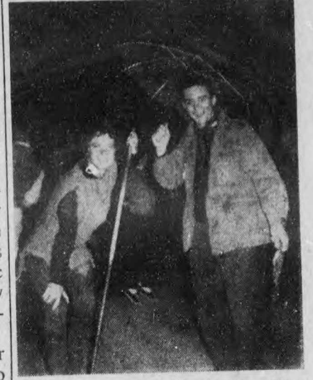
... up at Sadie Hawkins