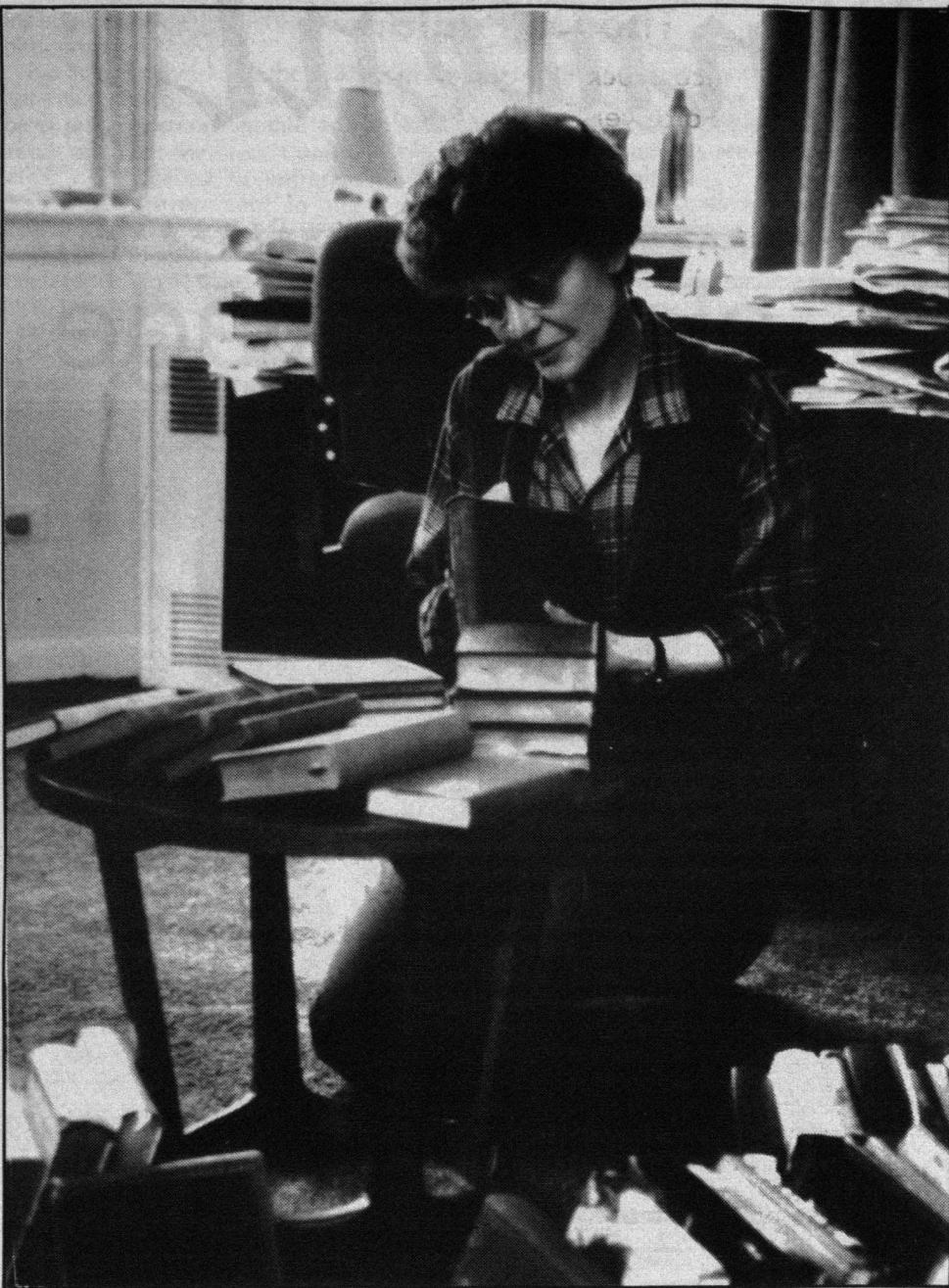
Anne Bancroft as Helen Henff unloads another case of books from across the Atlantic.

84 Charing Cross Road Columbia Pictures Westmount 1