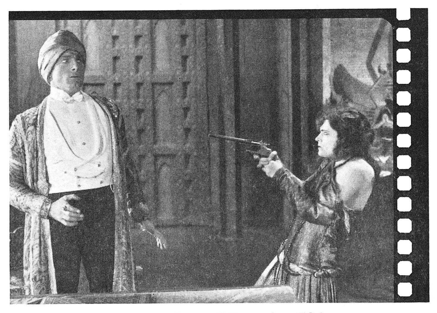
"Back off, Swami! I'm going TCAand never mind that old magic carpet bit!"

Near the Campus at: 10470 - Whyte Ave. 9516 - 118 Ave., - 10075 - 156 St., Open Thurs. 'till 9 p.m.