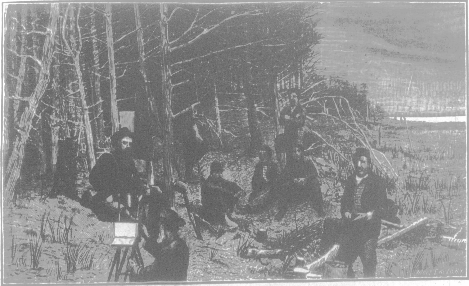
GOVERNMENT EXPLORING PARTY ON QUEEN CHARLOTTE ISLANDS.