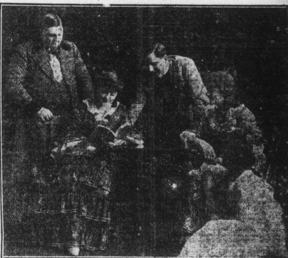
THE OLD HOME SINGERS.