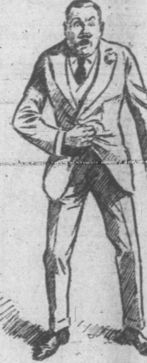
THAT BARGAIN YOU PICKED UP AT FIVE DOLLARS PER QUART

With an absentee Premier and a Cabinet, about half of whom are sanitarium patients, it is difficult to predict what will happen this coming session. The whole Union Government may "blow up" with a loud explosion at any time, and Borden may return to find his creation has dissolved. Certainly Sir