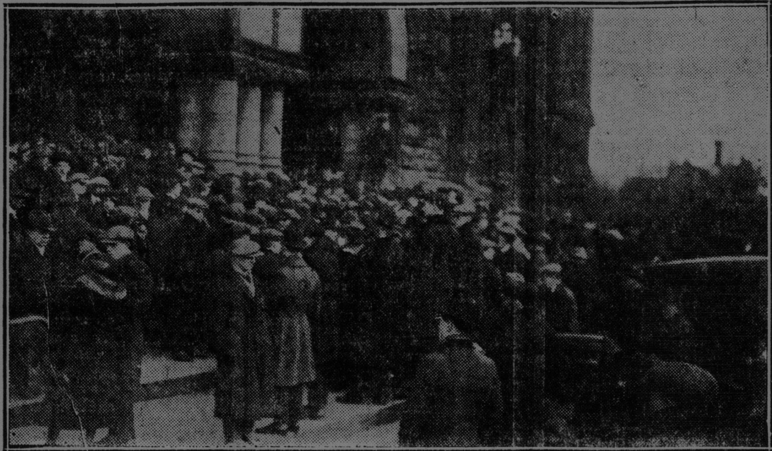
The unemployment situation in Toronto was emphasized the other day when thousands of workless veterans marched to the Parliament Building and laid their demands for relief before the Drury cabinet. Afterwards they marched to the City Hall and placed their demands before the mayor and board of control. The Provincial and Municipal governments promised to act immediately toward providing temporary employment. Photo shows the crowd storming the parliament buildings.