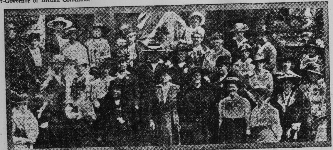
The picture, taken at the entrance of the Empress Hotel, shows many of Canada's leading women, as follows, (left