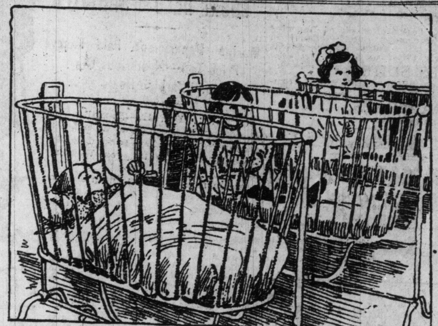
These are the French Cots from the Heine Croche in Paris—the Youngsters can't tumble out. A Friend Gave a Dozen of these Cots to the Hospital.

Remember there are 140 Patients, 60 Nurses and 30 other Helps—a Household of 230