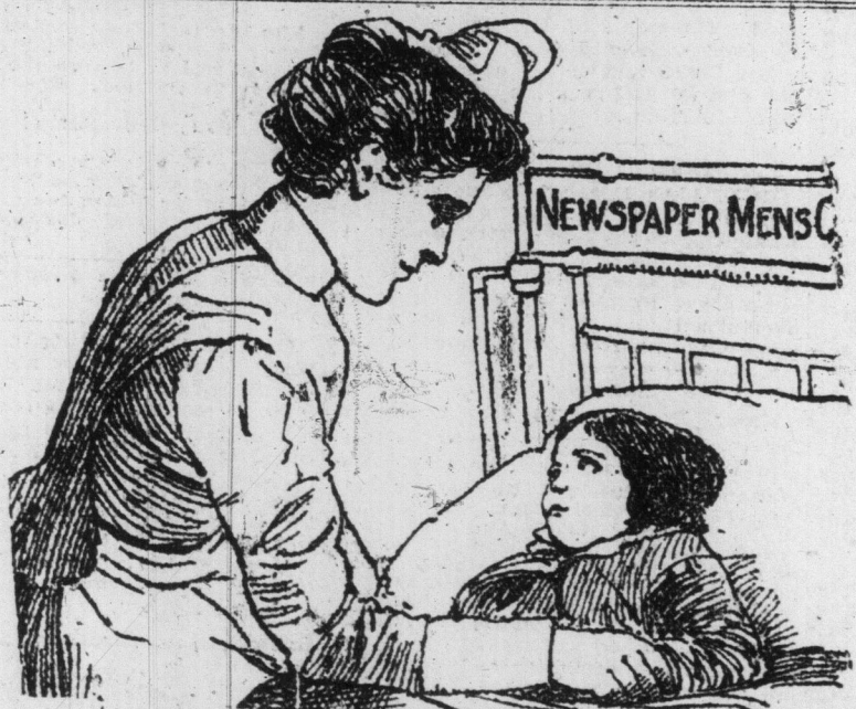
This is the Newspaper Men's Cot—Named in Perpetuity by the Newspaper Men of Ontario—This Lass has just been awakened and the Nurse is trying to comfort her.

—to Restore to Health, to Correct De- formities in the little ones who seek our aid.