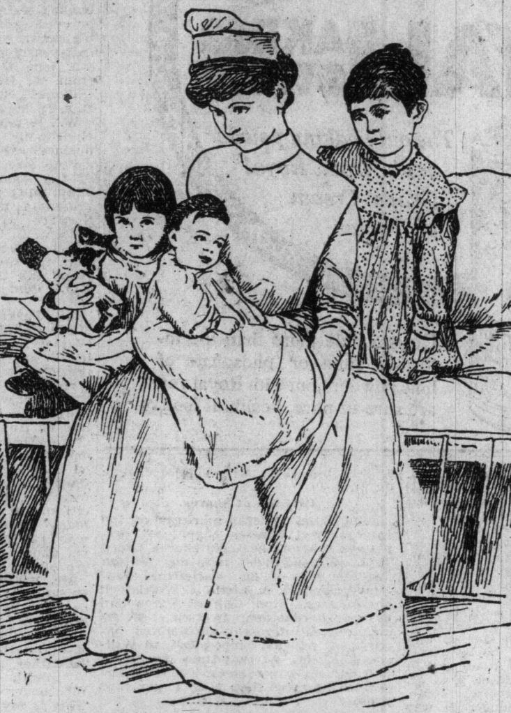
Think of all the Loving Care these Little Ones Get—How Tenderly they are Looked After—This is an Everyday Sketch.

These Youngsters are Happy with their Nurse.