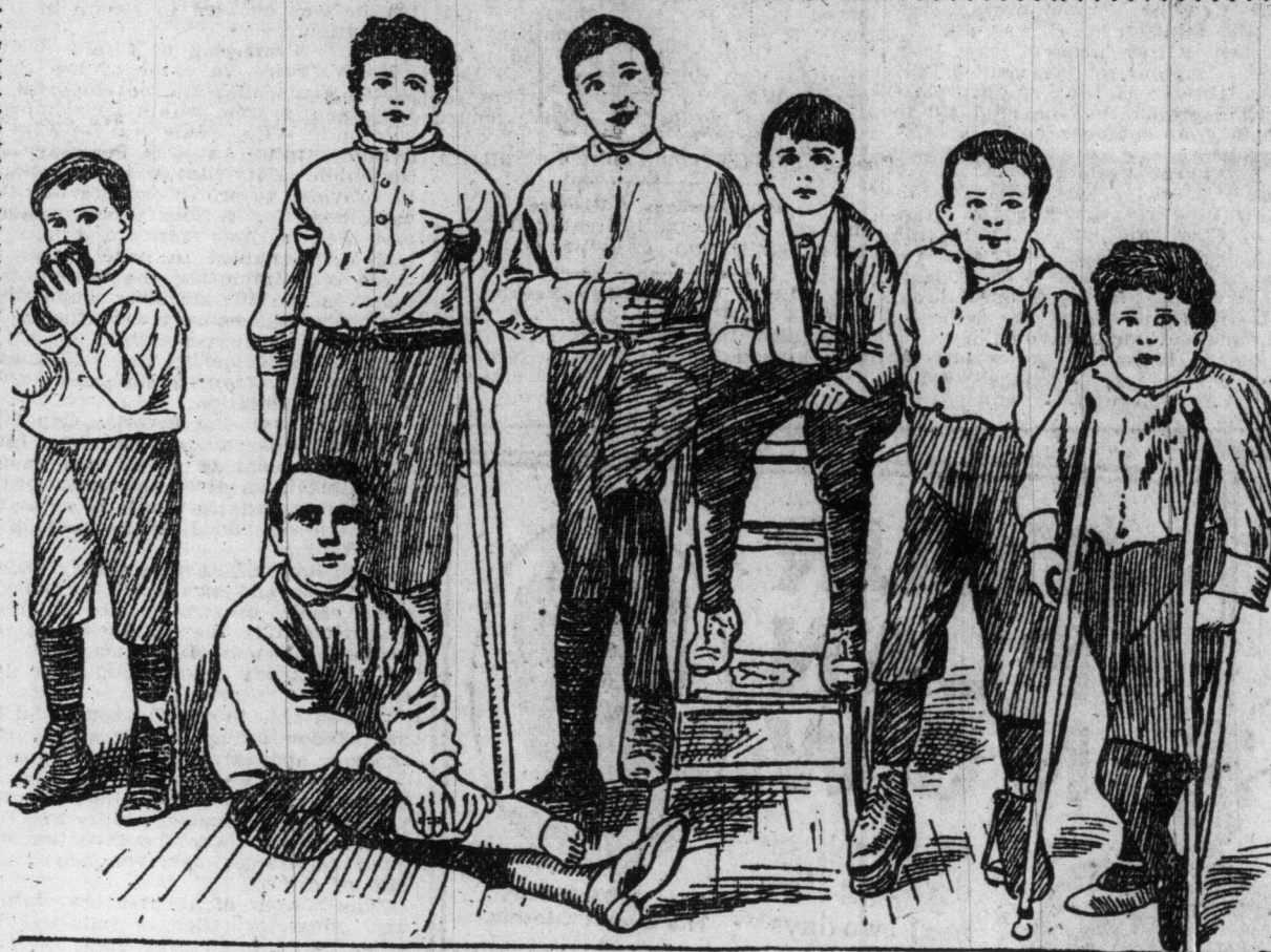
This is a Sketch from Life in the Surgical Ward—Three are Accident Cases—Four are Hip Cases—All were Discharged in Good Condition.

Sickness is a Heavy Handicap in Life's Struggle, which the Hospital with Your Help Can Lift from Many Children.