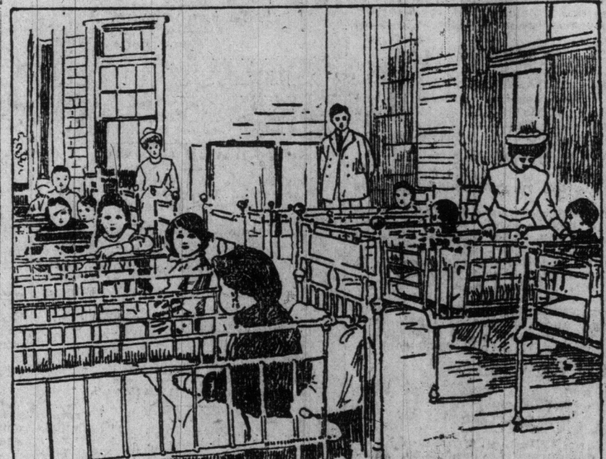
This Sketch was made Last June on a Balcony Ward at The Lake- side Home, where 350 Children were Nursed Last Summer.

Fourteen Cases of Bow Legs were Corrected. Free Patients