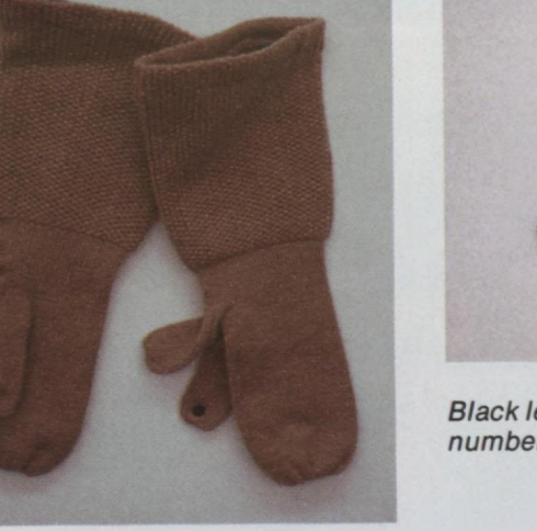
Trigger finger mitten liner (gauntlet cuff) style no. 1000.