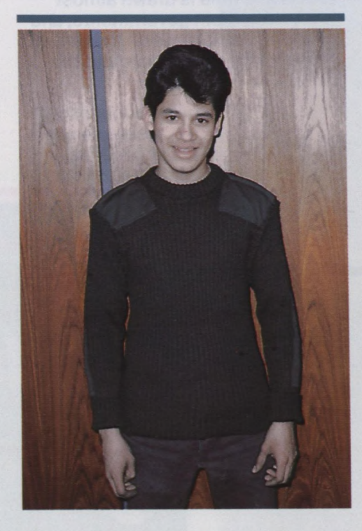
Combat style crew-neck sweater.

The company's Glove Knitters division specializes in such products as combat liners, trigger mittens and dress cadet gloves, and has supplied the Canadian Department of National Defence and their leather glove suppliers for many years.