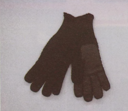
Black leather-palm cadet gloves style: number 305.