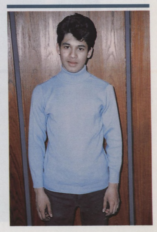
Turtleneck sweater available in acrylic, blends or 100 per cent wool.

extreme alicul edequate pro adverta weak mail. Proper es piles can mabetweet life