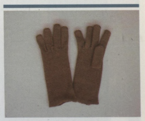
Glove lining (style no. 312).