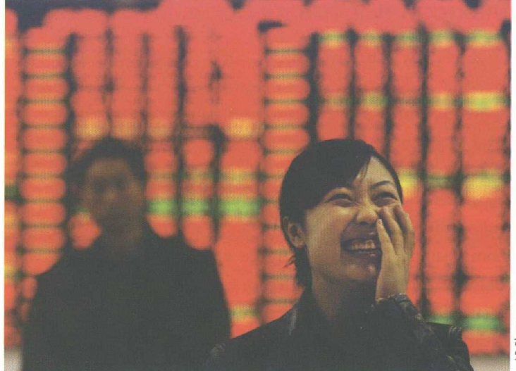
An investor reacts to rising share prices at a stock exchange in Kunming China. The city has been spruced up as part of China's "go west" campaign, aimed at increasing investment in the remote western regions.

The nod means that Ryerson students who have successfully completed the courses in international business, marketing, law and management can now leapfrog to advanced standing towards the educational requirements of FITT's own Certified International Trade Professionals designation, or CITP.