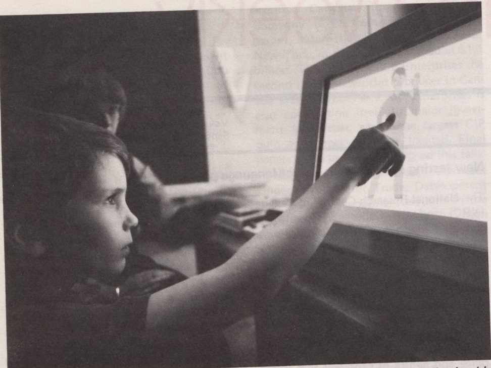
Using the new testing system, a student responds to an audio message indicating his answer by touching the appropriate portion of the touch-sensitive screen.

portable units which could be easily relocated and reassembled.