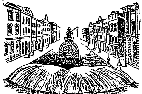
Studebaker Sprinkler (PATENT IMPROVED.)

Does not clog or get out of order. Greatest width of spray Can be graded from driver's seat to any volume.