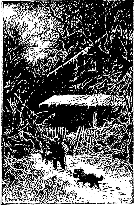
NEW YEAR'S EVE.