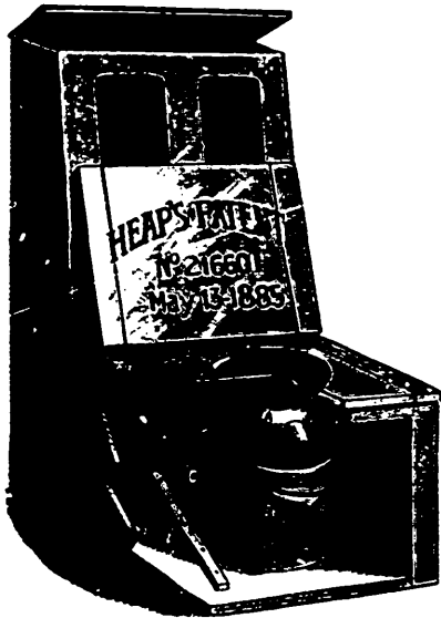
Inodorous Portable Bedroom Commode

- A Special Silver Medal Awarded at Toronto, 1885 -