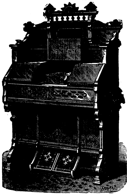
STYLE 26 B, - PRICE $115.00.