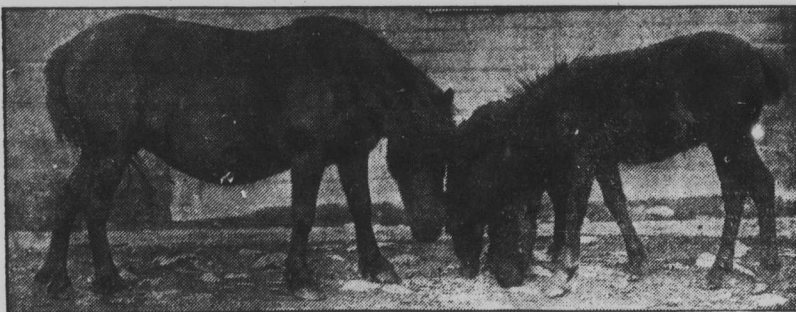
Edith of Transy and her foal, and a foal she is nursing besides.