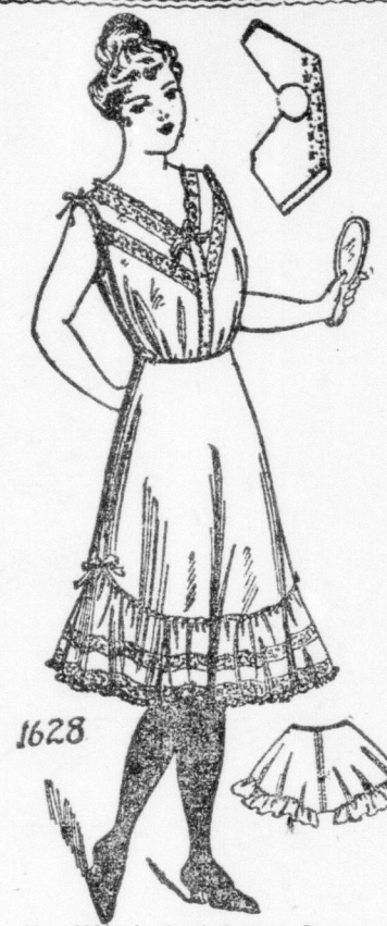
No. 1628—Ladies' Corset Cover and Drawers.

16. Verses 27-28.—What is the difference between a Christian who, from prejudice, speaks evil of another Christian, and those Jews who spoke falsely of Paul?