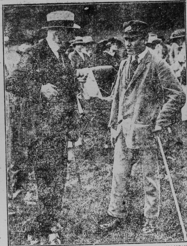
MOST RECENT PHOTOGRAPH OF THE DUKE OF CONNAUGHT. The former Governor-General of Canada chatting with a wounded soldier at an Ascot lawn fête.

A pitcher of mignonette, In a tenement's highest casement; A queer sort of flower pot, yet That pitcher of mignonette, Is a garden in heaven's view. To the little sick child in the basement. Just a pitcher of mignonette In the tenement's highest casement.