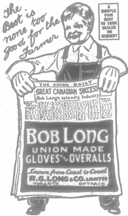
Our Breeding and Quality