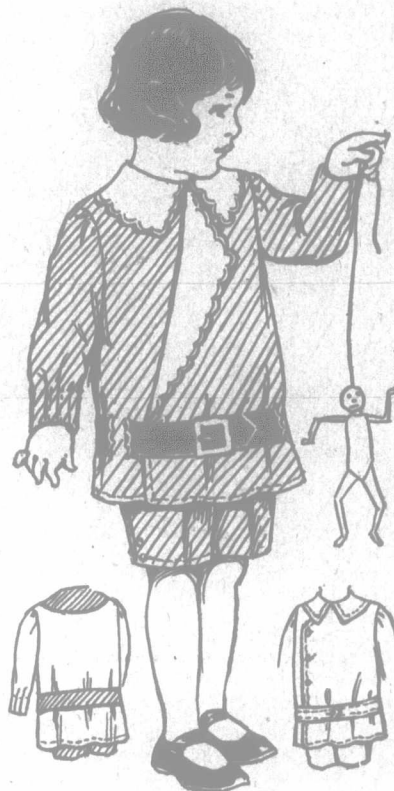
8729—Boy's Suit, 4 to 8 years.