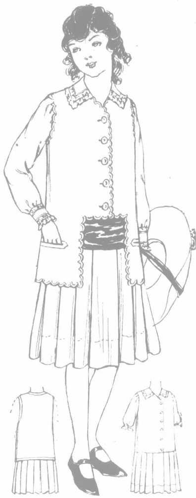
8668—Girl's Dress, 10 to 14 years.