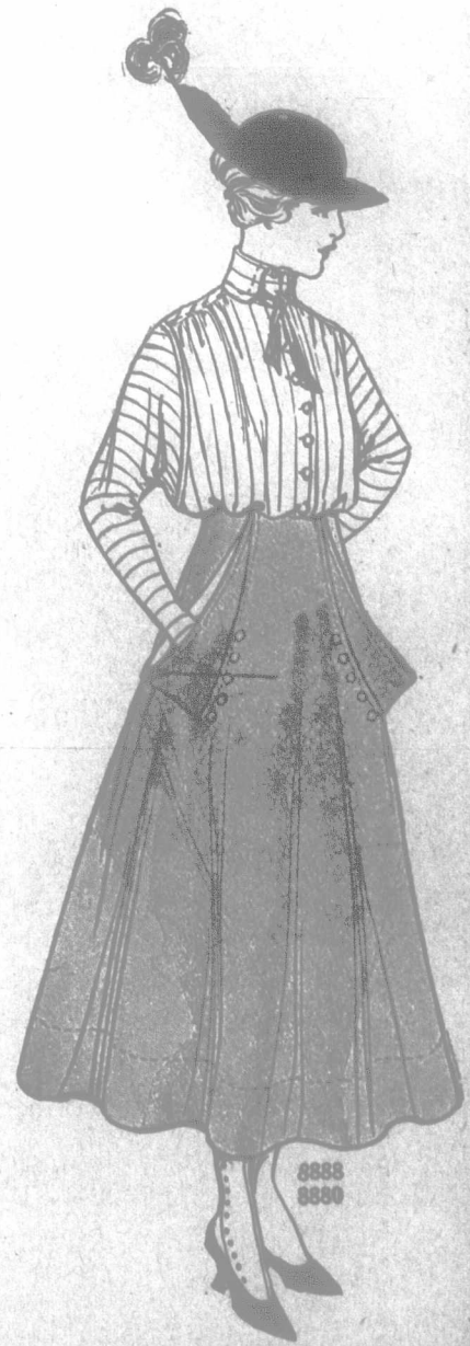
8888—Gathered Blouse, 34 to 42 bust. 8880—Two-piece Skirt, 24 to 32 waist.