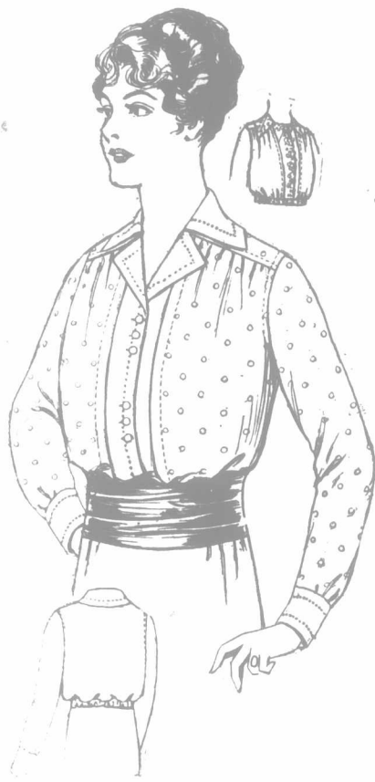
8823—Girl's Dress, 6 to 12 years.