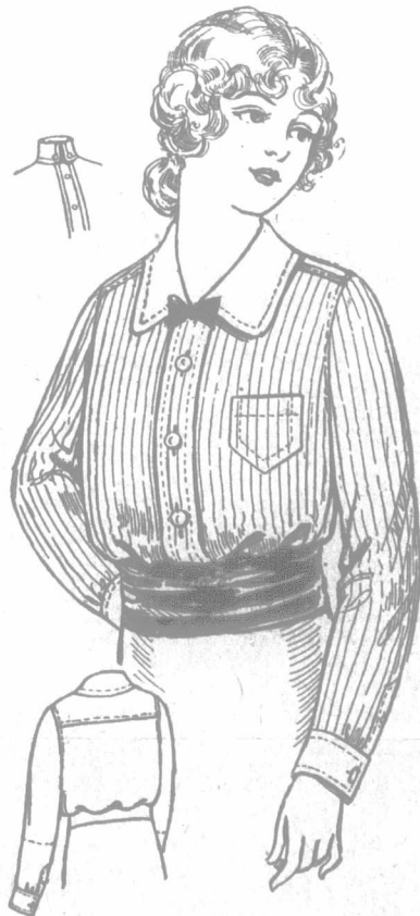
8480—Waist for Misses and Small Women, 16 and 18 years.