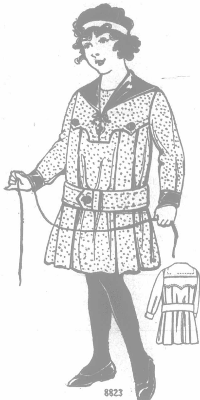
8823—Girl's Dress, 6 to 12 years.