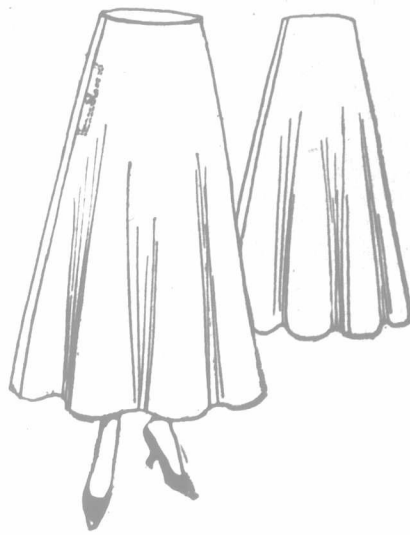
8851—Two-piece Skirt, 24 to 34 waist.