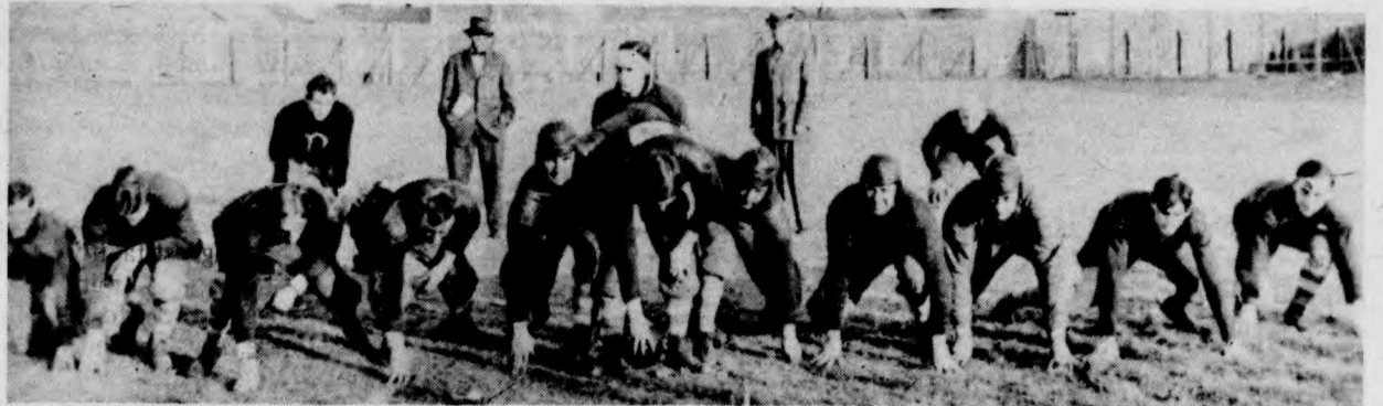
A kamikaze team of stalwart students crouch in readiness for an assault on the Central Square cafeteria noon-hour line-up.