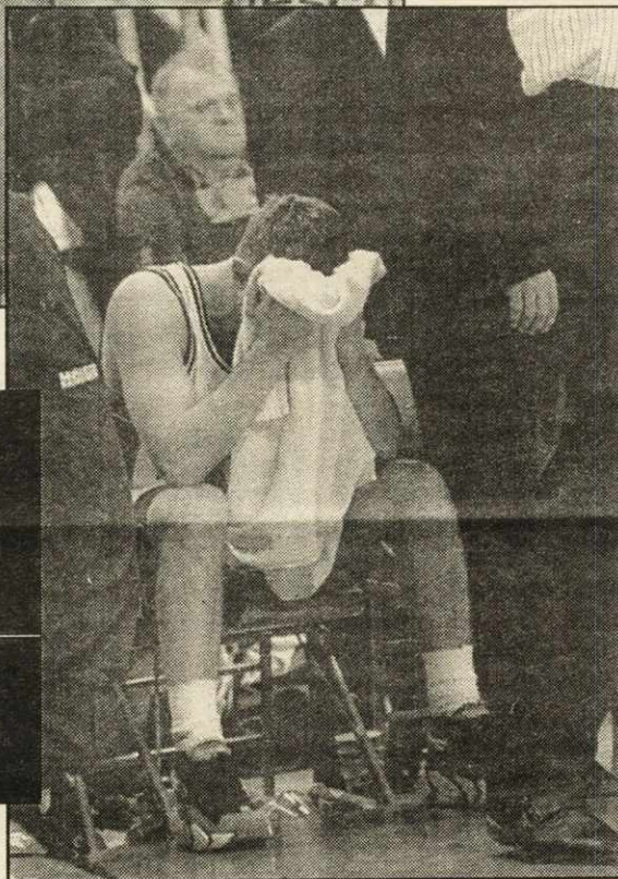
Here are some snapshots from last weekend's basketball action at the Metro Centre.