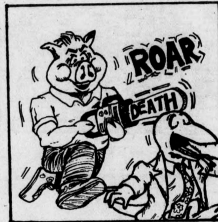
S.M.A.R.T. P.A.C.C. Pig Booze Ø "Hunting down that @#?! lizard!!!"