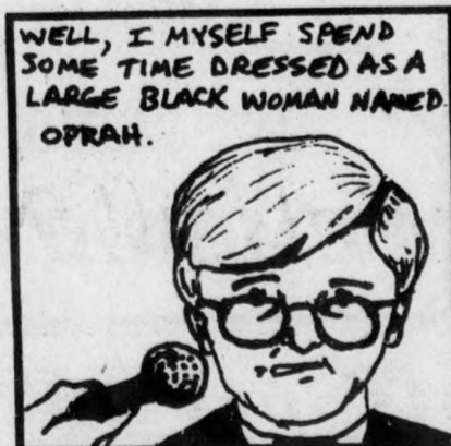
PHIL DONAHUE HOST/HOESSES