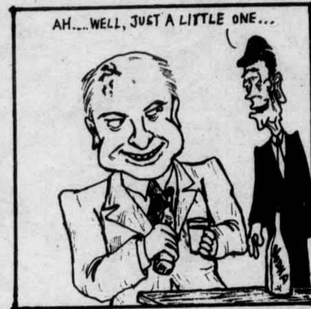
Mikhail Gorbachev CCCP "Getting Reagan smashed for arms talks!"