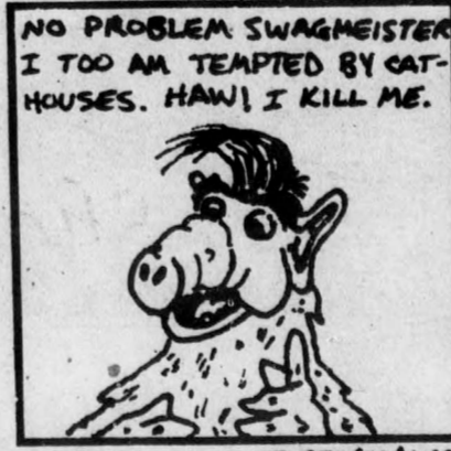
ALF JUST KIDDING