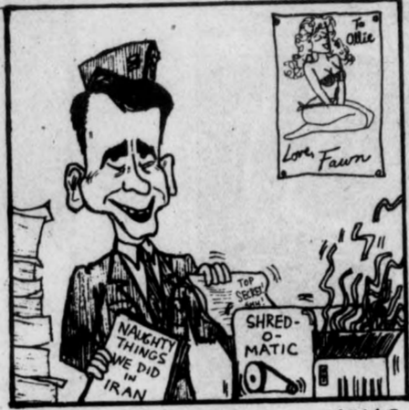
Oliver North USMC "Making paper maché."