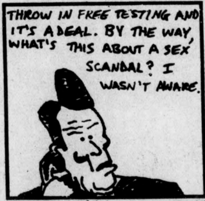
RONALD REGAN FREE