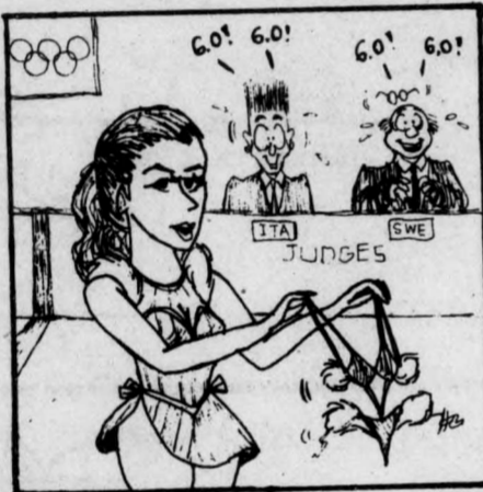
Katarina Witt GDR "Picking out new skating outfits."