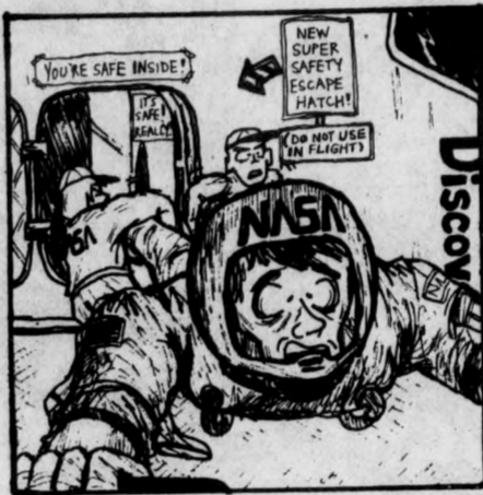
Shuttle Astronaut NASA I "PRAYING!!!"