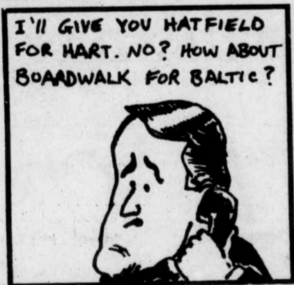
BRIAN MULRONEY FREE TRADE

Q: WHAT DO YOU THINK OF THE RECENT SEX SCANDALS SWEEPING NORTH AMERICA? by PHIL PITTS