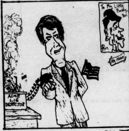
Brian Mulroney PM IV "Proving that I do NOT kiss up to the Americans... yeah, that's the ticket..."