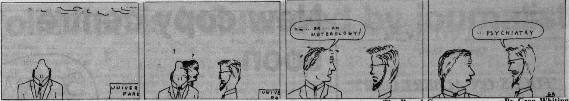
The Round Corner By Greg Whiting