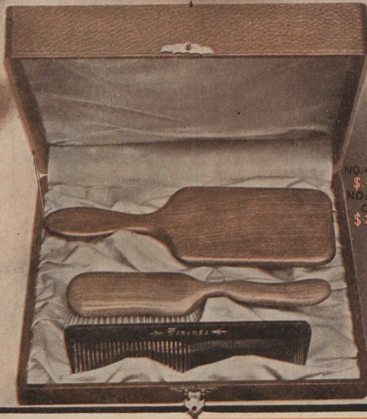
NO. 4 CASE $.450 NO. 4 EMPTY CASE $.250