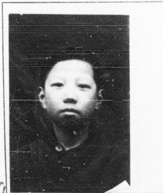
Photo attached to birth Certificate August 1st., 1946

This is to certify that the party registering (is) (is not) the party whose photograph appears on the certificate above stated.