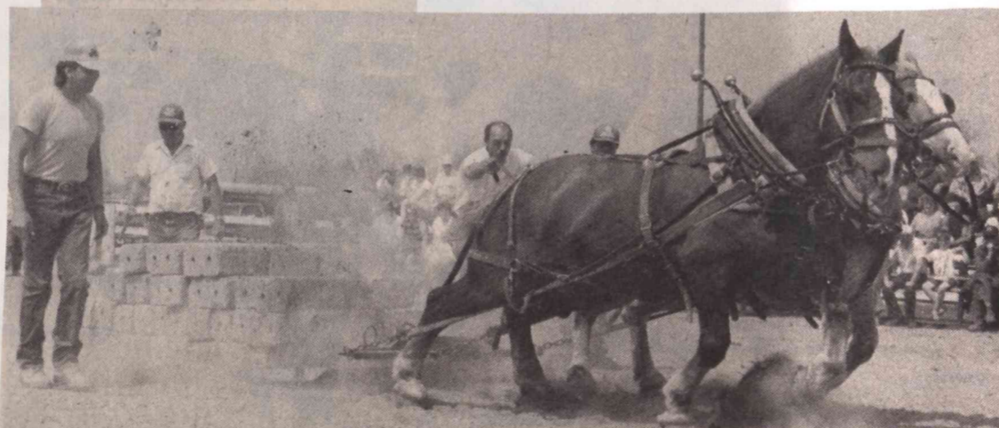
A team of horses get their weight into the horse pull in South Mountain May 17. About a dozen teams of horses and their owners tested their skills on the Fair Grounds. This duo was staggering under 1,850 pounds of concrete.