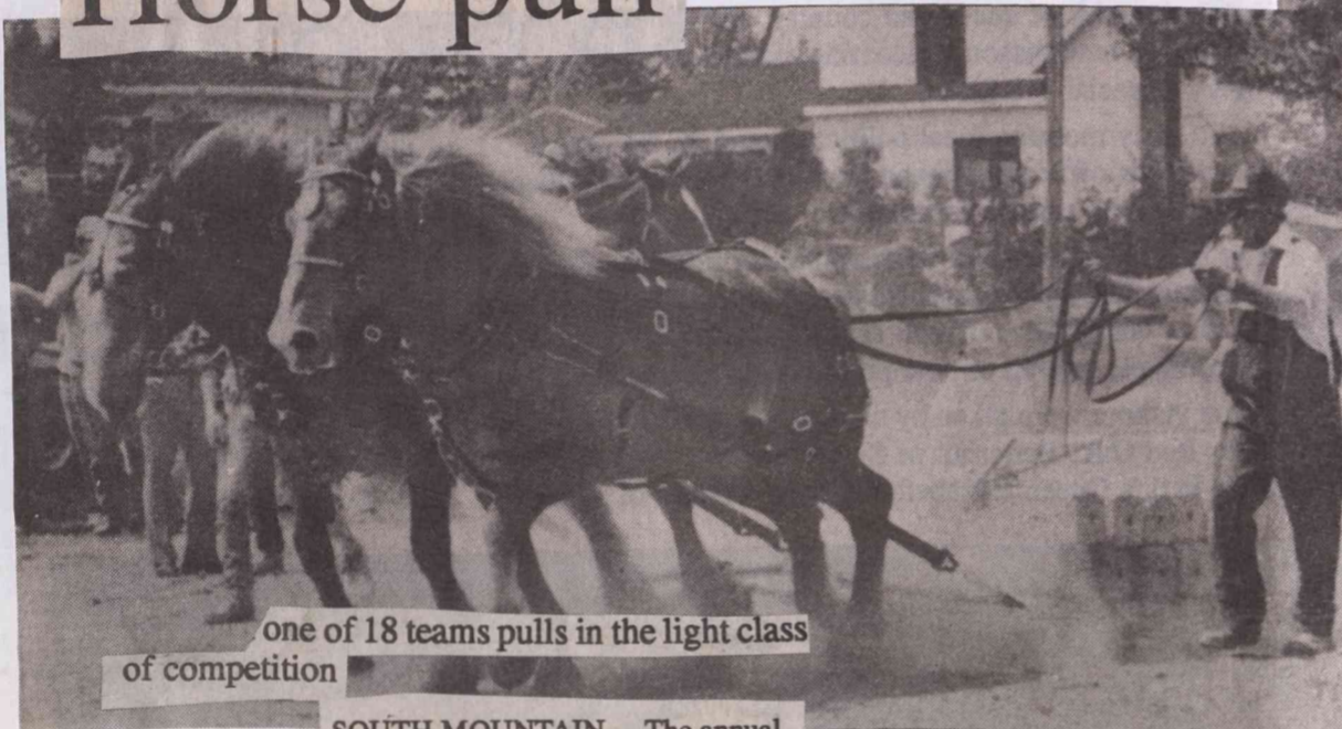
one of 18 teams pulls in the light class of competition