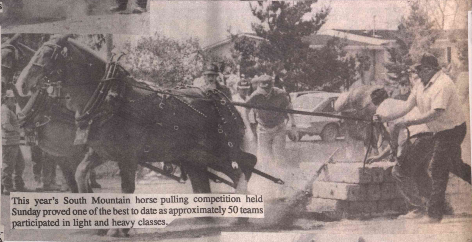
This year's South Mountain horse pulling competition held Sunday proved one of the best to date as approximately 50 teams participated in light and heavy classes.

Besides the horse pull competition, a field day was also featured. A pork barbecue was available as well.