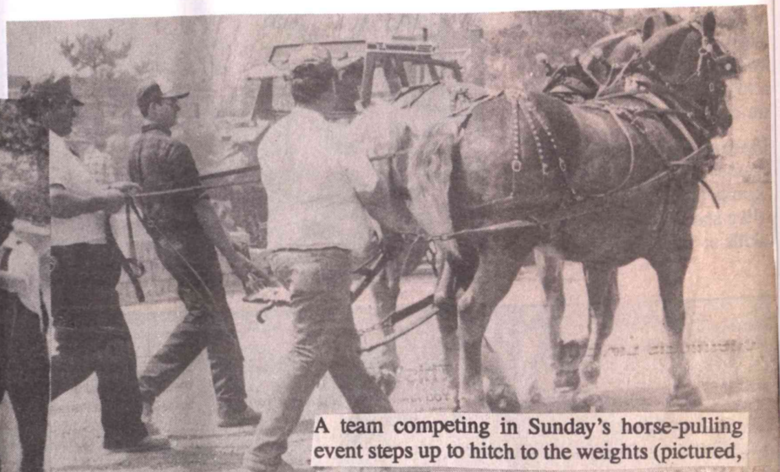
A team competing in Sunday's horse-pulling event steps up to hitch to the weights (pictured,

SOUTH MOUNTAIN — The annual Victoria Day weekend horse pulling competition held at the fairgrounds in South Mountain attracted 50 competitors from across Ontario and Quebec.