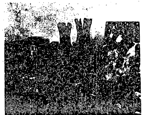
A portion of Gershon Iskowitz' studio.