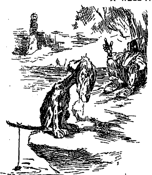
1. Mind, dah! Brutus