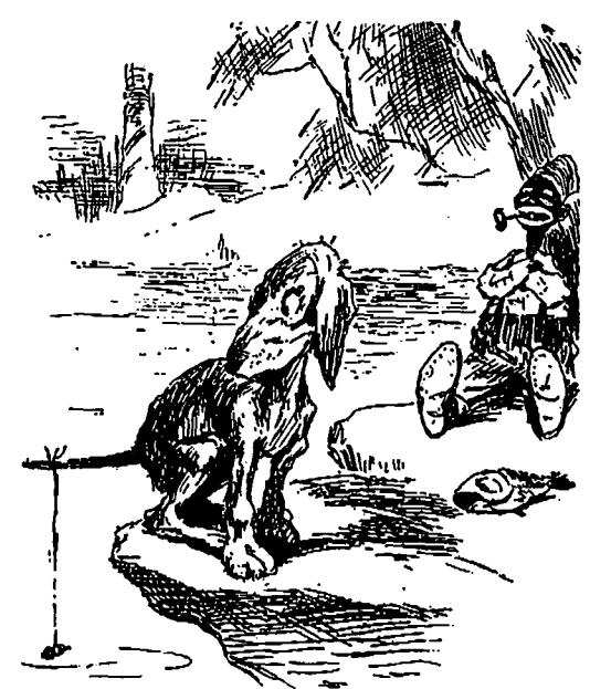
3 Well done! try again.