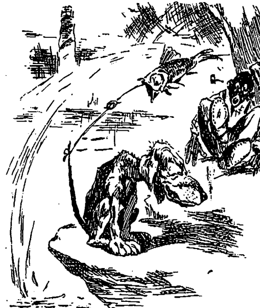
2. Pull im in i