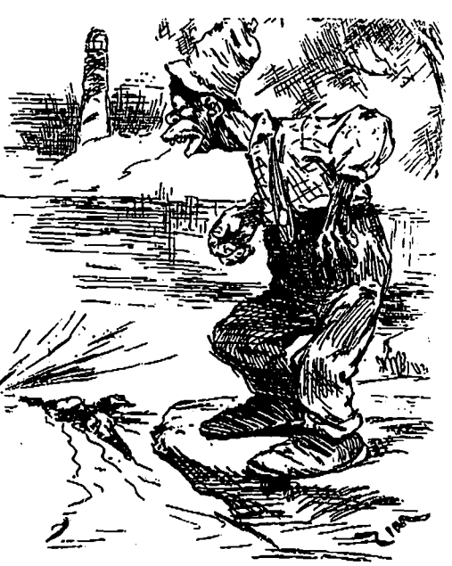
4 Gracious me! that must ave been a dwag fish!