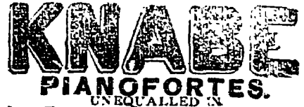
KNABE PIANOFORTE. Fine, Touch Workmanship and Durability.

Remember they are now at the ALBION HOTEL, McGill Street, Montreal, where they will remain for a short time only. If you cannot call, write to the ERIE MEDICAL AND SURGICAL ASSOCIATION, Cor. Main and Swan Sts., Buffalo, N.Y., U.S.A.