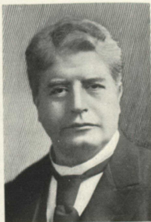
SIR EDMUND BARTON—AUSTRALIA