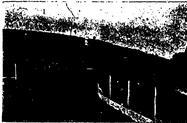
DENTONIA MODEL ISOLATION DOUBLE PEN.

white, buff and brown Leghorns, white Langshans, black and white Javas, Andalusians, bronze and white Turkeys, Pekin Ducks, Embden Geese, etc., were all in the pink of condition, as they could not otherwise be in such quarters, and out of the entire flock we saw but one bird—suffering from a nervous disease—that looked in the least to be ailing. The quality of the birds is high, many winners being amongst them and their produce should prove of merit.