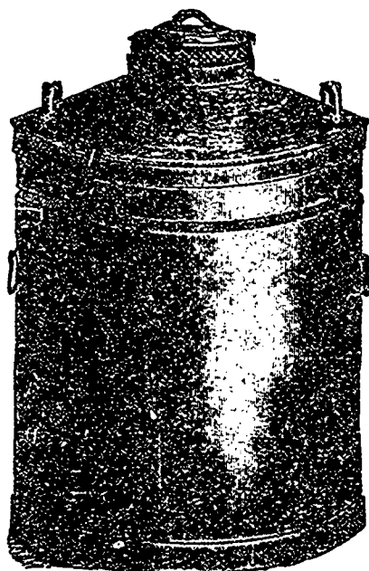
"EMPIRE STATE" MILK CAN.