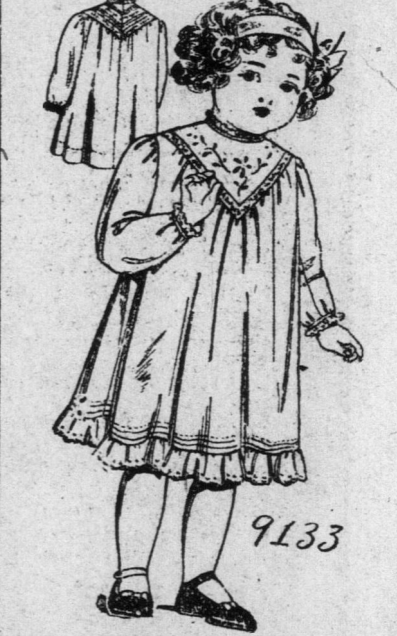
Child's Yoke Dress With or Without Tucks and Ruffle. Lawn, muslin, dimity, mull or similar fabrics are suitable for garments of this style, with embroidery, lace or tucking for the yoke. The ruffle may be of embroidery or lace. The pattern is cut in 4 sizes: 6 months, 1, 2 and 3 years. It requires 2 3/4 yards of 36 inch material for the 3 year size. A pattern of this illustration mailed to any address on receipt of 10c. in silver or stamps.