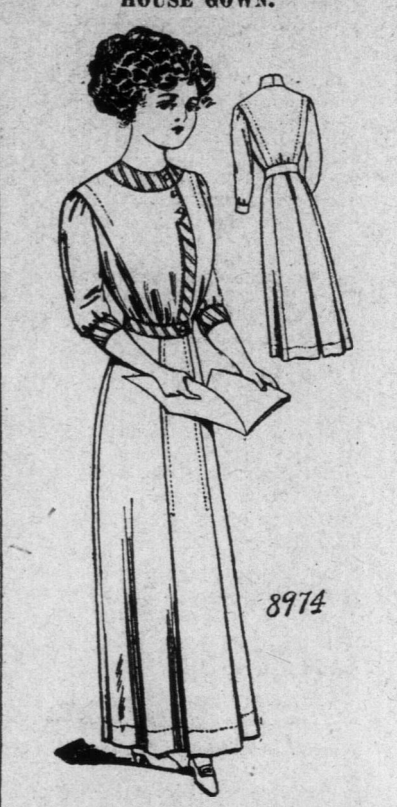
Ladies' One or Two Piece House Dress, With Seven Gore Skirt, and Sleeve in Either of Two Lengths. Blue chambray was used to make this design, with trimming of striped blue chambray. The fronts are crossed to effect the pretty side closing and are finished with an insert that is very smart. The front gore shows tucks at the seams. The pattern is cut in 6 sizes: 32, 34, 36, 38, 40 and 42 inches bust measure. It requires 6 yards of 44 inch material for the 36 inch size. A pattern of this illustration mailed to any address on receipt of 10c. in silver or stamps.

8974.—A POPULAR AND FETTERING HOUSE GOWN.