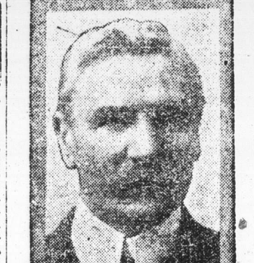
New Bank President

and punitive measures, and that while This explains' the mysterious rum- negotiations are in progress the Gov-