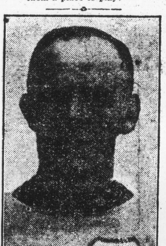
A Hockey Star

Larger bill for a darker ill, so give them a place to play!