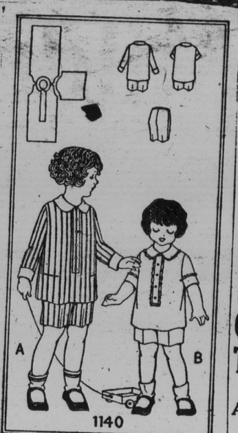
THE WELL-DRESSED BOY'S SUMMER SUIT.

Age counts when you are dressing the boy, and there is nothing more serviceable, nothing neater in appearance, and for summer coolness than the wash-suit, which has long been a favorite with the little chaps. Past-color Devonshire cloth fashions the suit of striped material, with its centre-front closing under a flat plait trimmed with buttons. The neck is high, and the collar is comfortable-fitting. The long sleeves have a turn-back cuff, and set-in pockets trim the front of the jacket. The straight knickerbockers fit well and have side closing. The little fellow wears a suit of blue percale with short sleeves, and narrow fitting, outlining the cuffs, collar and front plait. Sizes 2, 4 and 6 years. Size 4 years requires 1 1/2 yards of 32-inch, or 1 3/4 yards of 36-inch material. Price 20 cents. Our Fashion Book, illustrating the newest and most practical styles, will be of interest to every home dress-maker. Price of the book 10 cents the copy. Each copy includes one coupon good for five cents in the purchase of any pattern.