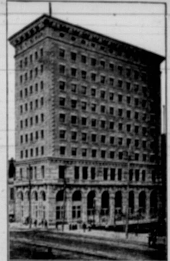
Union Bank Building, Winnipeg