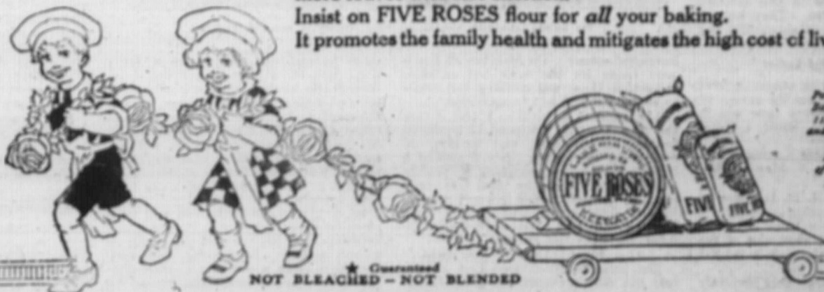
Packed in Bags of 5, 10, 25, 50, and 100 lbs. A 100 lb. barrel of 1 and 25 lbs.

OVER 200,000 WOMEN HAVE SENT for this 144-PAGE BOOK It gives many uses for stale bread and cake: French toast, bread puddings, bread crumbs, croquettes, pulled bread, bread diet. A splendid chapter on sandwich making. ALL ABOUT BREAD AND CAKE MAKING The famous FIVE ROSES Cook Book also gives complete, understandable information on pastries, tarts, puddings, biscuits, buns, rolls, fried cakes, cookies, etc. Over 200 tested cake recipes. Crowded with the best selected recipes of thousands of successful users of FIVE ROSES flour throughout Canada. Send for your copy of the FIVE ROSES Cook Book, mailed for 25 two-cent stamps. Address Dept. T, LAKE OF THE WOODS MILLING CO., LIMITED, WINNIPEG.