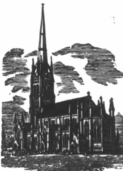
St. James' Cathedral, King St., Toronto, contains 500,000 cubic feet of space and is successfully heated with four of our Economy Heaters.