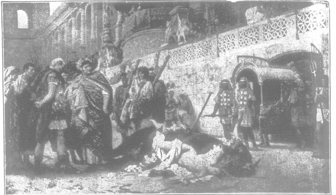
Nero at the Circus

A great special limited offer to the readers of Farmers Advocate. Send the free coupon at the bottom of this page and get the full details today.