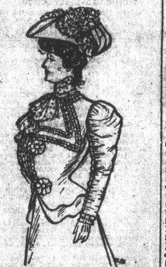
SMART LITTLE COATS.

As the spring makes itself felt the providing of linen coats becomes an immediate necessity. The one pictured here is at once very pretty and simple, the back being quite plain, while the fronts, graced by a stitched box plait,