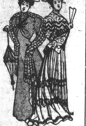
NEW SPRING TOILETS.

An extremely chic model exploits a skirt of black gauze over oyster silk, with a key pattern in black velvet out-