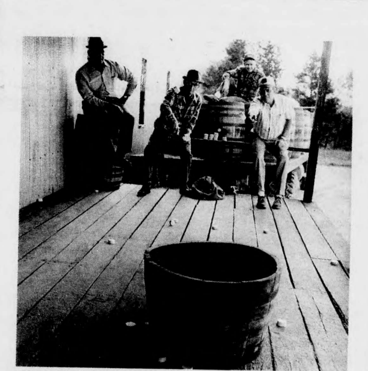
PITCHING BARREL BUNGS is a favourite game in Jack Daniel's Hollow and our barrelmen have a lot of time to practice because of the way we make Jack Daniel's Whiskey.